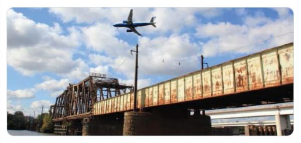
2:00 PM · Oct 21, 2019 · TweetDeck

TOMORROW: Don't miss the chance to comment on the Draft Environmental Impact Statement & other docs for the #LongBridgeProject, 4-7 p.m. @DCRA. Visit bit.ly/2kmWpR2. #dc #VA