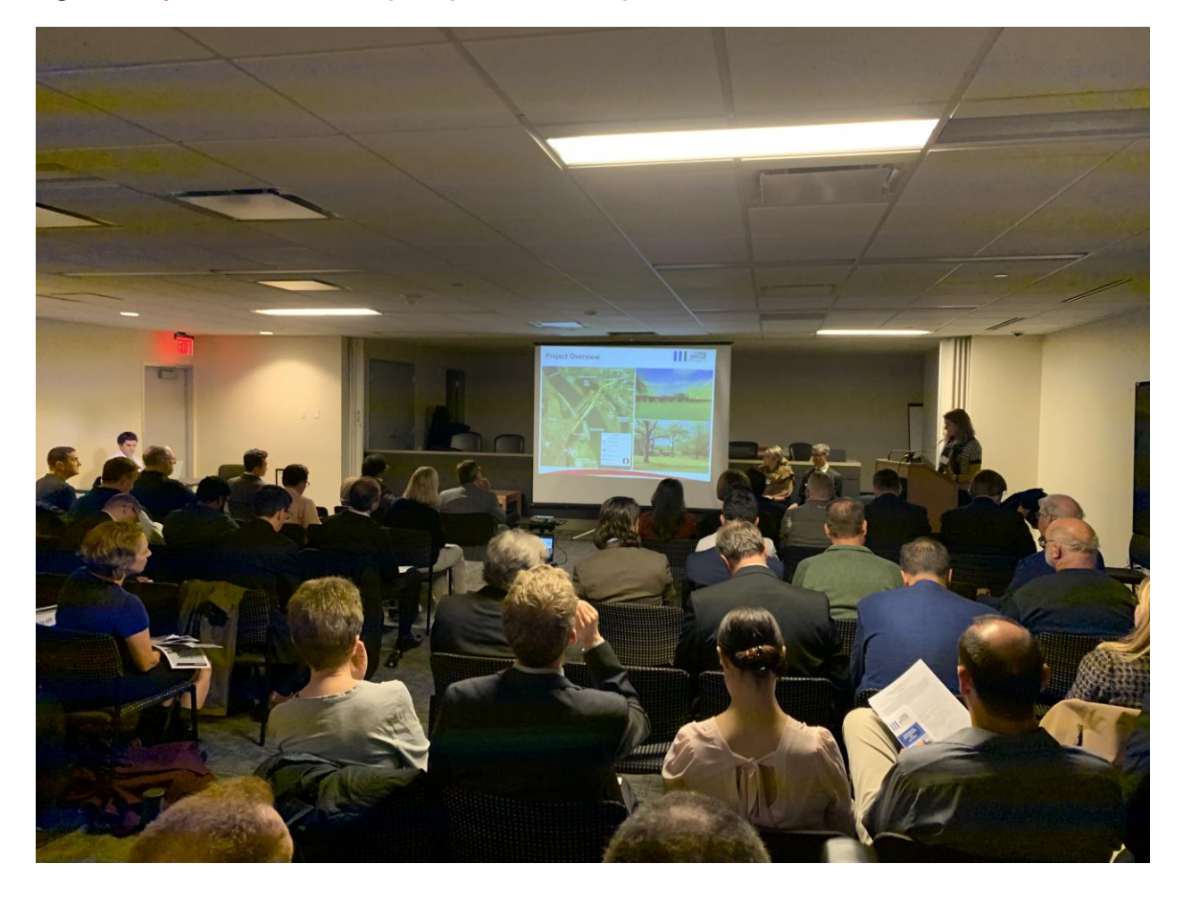
Figure 4-2 | Photo from the Long Bridge Public Hearing Presentation

Participants had two opportunities to attend the same formal presentation: 4:30 PM and 6:00 PM ( Figure 4-2 ). The presentation provided a more in-depth explanation of the information included in the exhibits. A copy of the presentation is in Appendix D . A formal public comment period was held following each presentation.