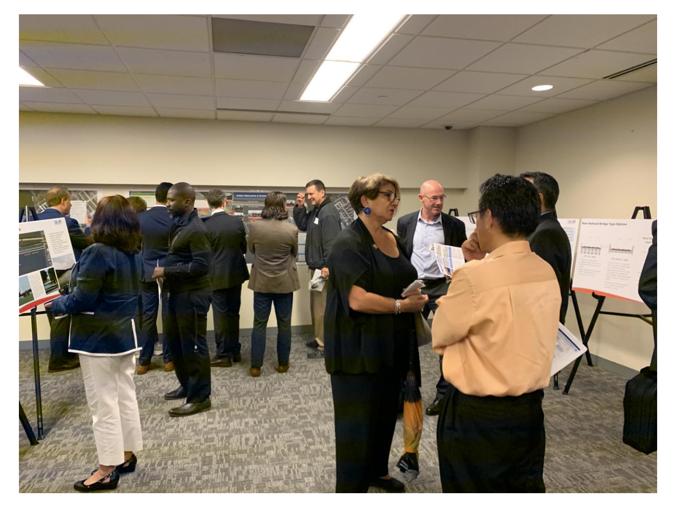
Figure 4-1 | Photo from the Long Bridge Public Hearing Open House

At the meeting entrance, attendees signed in, and staff offered them a fact sheet on the Project and a Title VI questionnaire. A copy of the fact sheet is in Appendix B and an example of the Title VI questionnaire is in Appendix F . As they entered, attendees had the opportunity to browse the informational exhibits around the room in an open house format ( Figure 4-1 ). The first grouping of exhibits provided background on the Long Bridge Project, the NEPA and Section 106 processes, the Project schedule, the Project Area, and the Purpose and Need for the Project. A second grouping of exhibits provided information on the No Action Alternative, the proposed new railroad bridge types, a comparison of the alternatives, the selection of the Preferred Alternative, an explanation of Section 4(f), and details of the potential Section 106 adverse effects to historic properties determination and proposed resolution strategies. Finally, two roll plots of Action Alternatives A and B showed the location of key impacts. A copy of the informational exhibits is in Appendix C . Staff were available to provide information on the Project and answer questions during the open house.