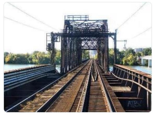
4:00 PM · Oct 15, 2019 · TweetDeck

One week from today: FRA & @DDOTDC host a #PublicHearing on the #LongBridgeProject @dcra. More info at bit.ly/2kmWpR2. #dc #VA