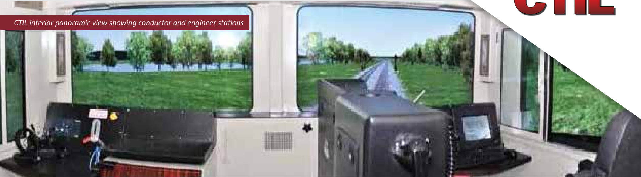
CTIL interior panoramic view showing conductor and engineer stations