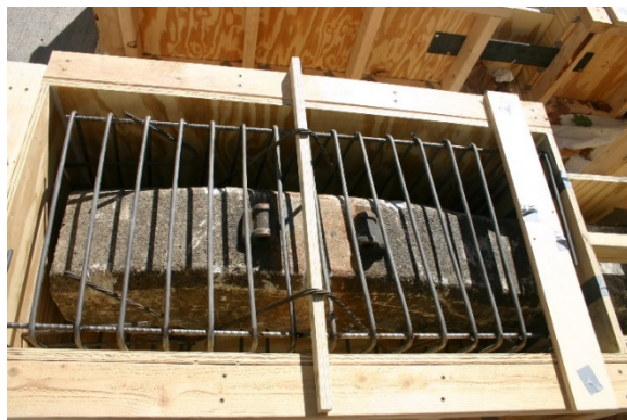
Figure 4: Spiral cage and concrete forming at tie ends