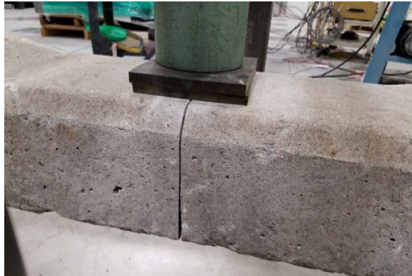
Figure 3: Loading at saw-cut to induce cracking