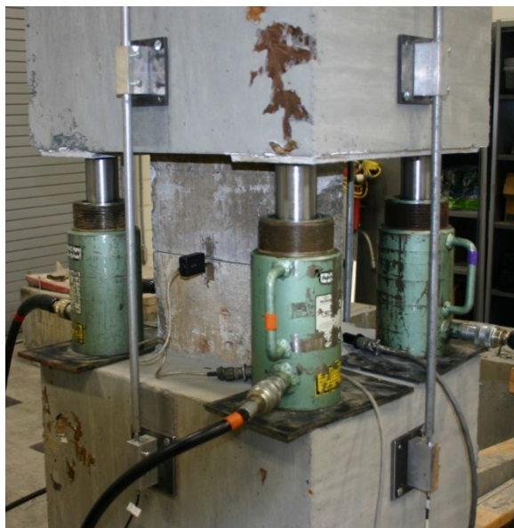
Figure 5: Jacks, LVDTs, and clip gage