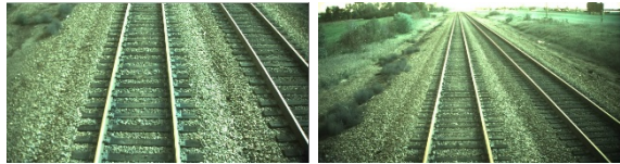
Figure 2. Example Images from FRA's Roadbed (left) and Right-of-Way DVIS (right).