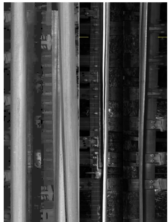
Figure 4. Extracted Images Surrounding a Switch Point from TCIS (top), RSIS (bottom-left), and JBIS (bottom-right)

Users can define the length of the image extracted from the machine vision systems by specifying the distance of the track before and after the event or exception of interest. The image-based reports and all exported imagery are available to FRA inspectors on the DOTX-220 following the surveys.