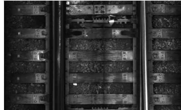
Figure 3. Example Exception Report (top) and Example TCIS Image at a GRMS Exception Location (bottom)

The geometry Image Exception Reports present data similar to other reports from FRA's ATIP fleet. The PDF report provides location and magnitude information about the individual exception as well as links to relevant extracted images. Images extracted from TCIS, the Roadbed DVIS, and ROW DVIS are automatically archived for evaluation.