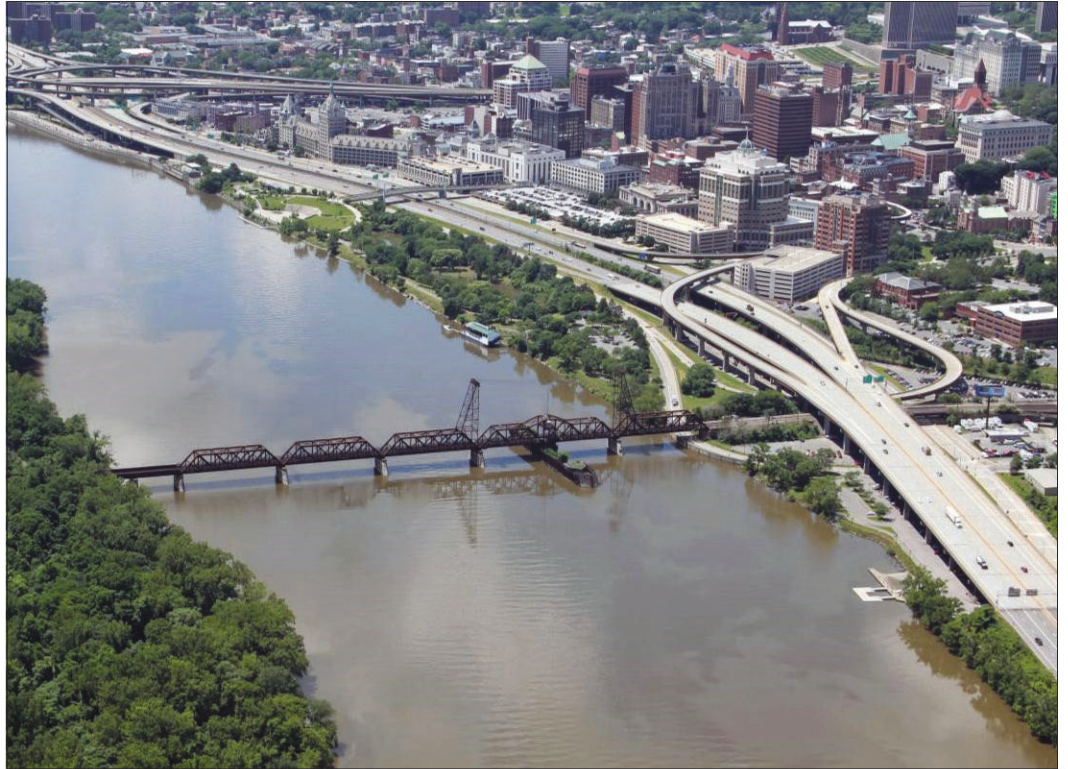
View southwest toward Albany 1