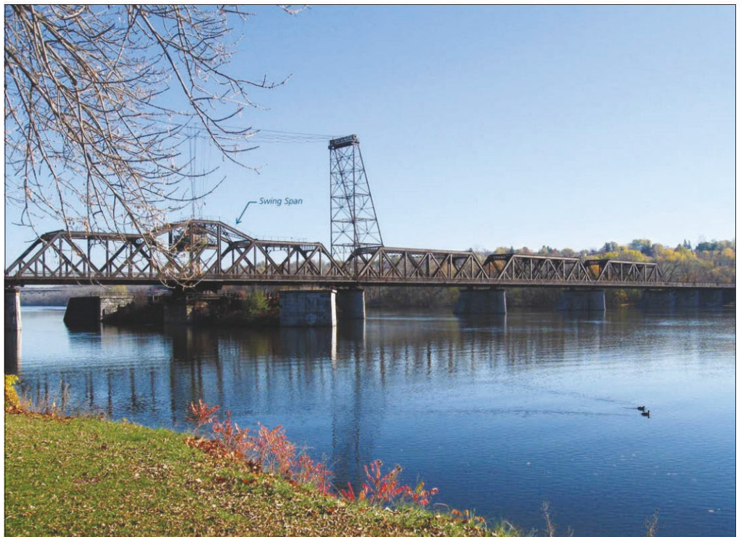
View northeast from Albany 2