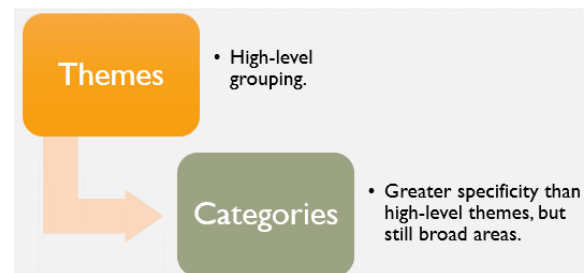
Figure 3. Overview of the data hierarchy

The strengths and gaps in safety culture identified in the reports were reviewed, themed, and coded into a two-level categorical hierarchy (see Figure 3). The prevalence of themes and the categories that comprised them were then estimated by calculating their frequencies across reports. The high-level themes that were identified in these reports closely align with safety culture constructs that have previously been established in the scientific literature. These themes and their measures have further been adapted and used as part of the SCA process (Kidida & Coplen, 2016).