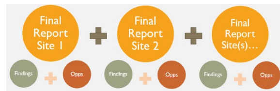
Figure 1. SLSI created nine Assessment Reports in 2021

Since 2015, SLSI has conducted voluntary, non-punitive, and confidential assessments of the safety culture at participating short line and regional freight railroads (i.e., Class II and Class III railroads) across the United States. SLSI uses a multi-method model, which has been recognized as "the most robust assessment model in the industry" by a Volpe National Transportation Systems Center evaluation (Kidda & Howarth, 2019). SLSI's Safety Culture Assessment (SCA) model, which includes interviews, on-site observation, and surveys, continues to provide tangible, action-oriented results for participating railroads.