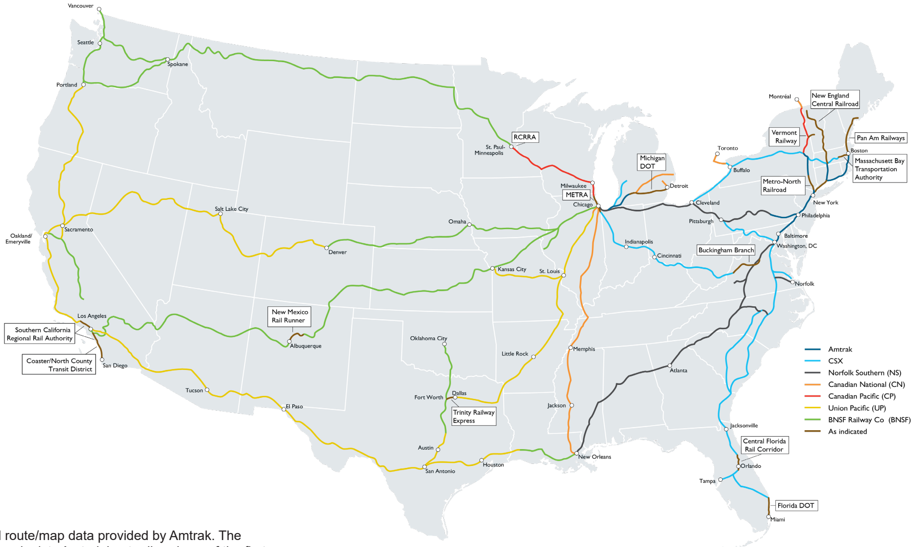
Figure 2. Amtrak Host Railroad Map

All route/map data provided by Amtrak. The map depicts Amtrak host railroads as of the first quarter of FY 2024.