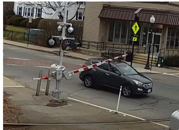
Figure 1. Crossing Gate Violation Example (Crossing ID# 546 729P)

crossing on Washington Street in Canton, MA (ID# 546 729P), which resulted in a broken gate.