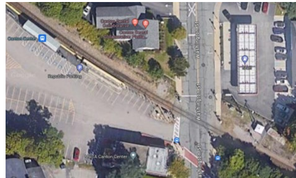
Figure 2. Washington Street Grade Crossing (Canton, MA)

The MBTA is the primary operating railroad using the crossing, with an estimated 28 trains per day on weekdays. There is no weekend commuter rail service. The Canton commuter rail station lies to the west of the crossing on the south side of the tracks, as shown in Figure 2 .