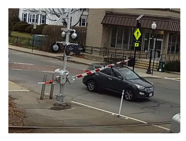
Figure 1. Crossing Gate Violation Example (Crossing ID# 546 729P)

crossing on Washington Street in Canton, MA (ID# 546 729P), which resulted in a broken gate.