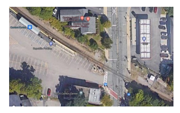
Figure 2. Washington Street Grade Crossing (Canton, MA)

The MBTA is the primary operating railroad using the crossing, with an estimated 28 trains per day on weekdays. There is no weekend commuter rail service. The Canton commuter rail station lies to the west of the crossing on the south side of the tracks, as shown in Figure 2.