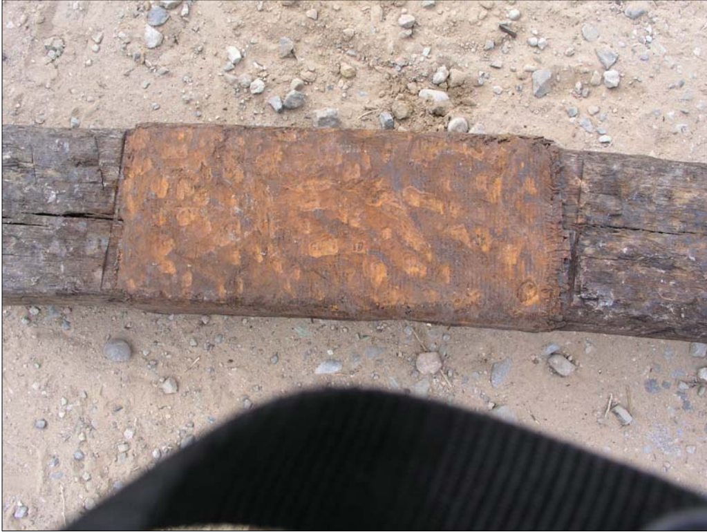
Figure 6. Bottom of Tie Removed from Track Showing Wrap in Good Condition