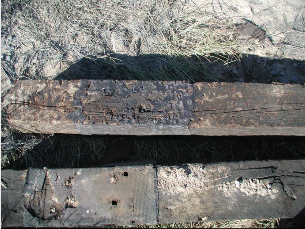
Figure 8. Bottom of Tie with First Generation Wrap after 356 MGT