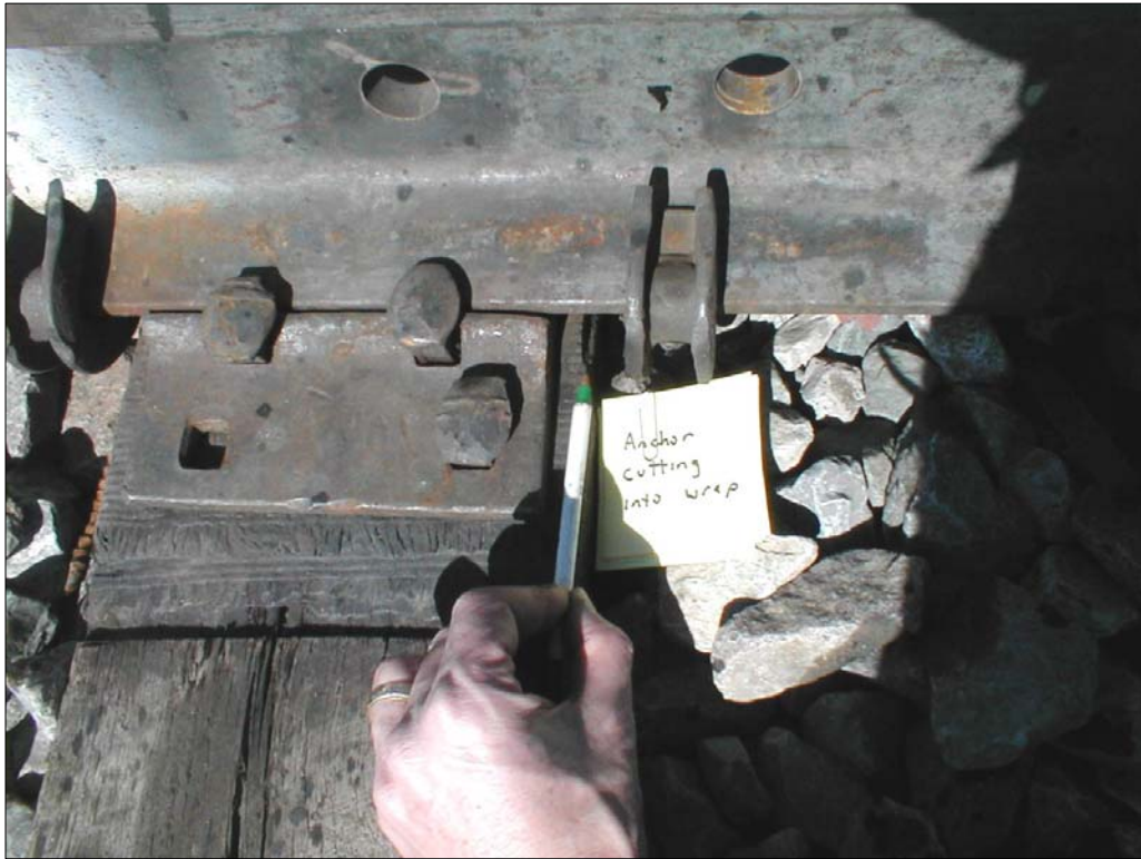
Figure 2. Damage to Wrap Caused by Rail Anchor