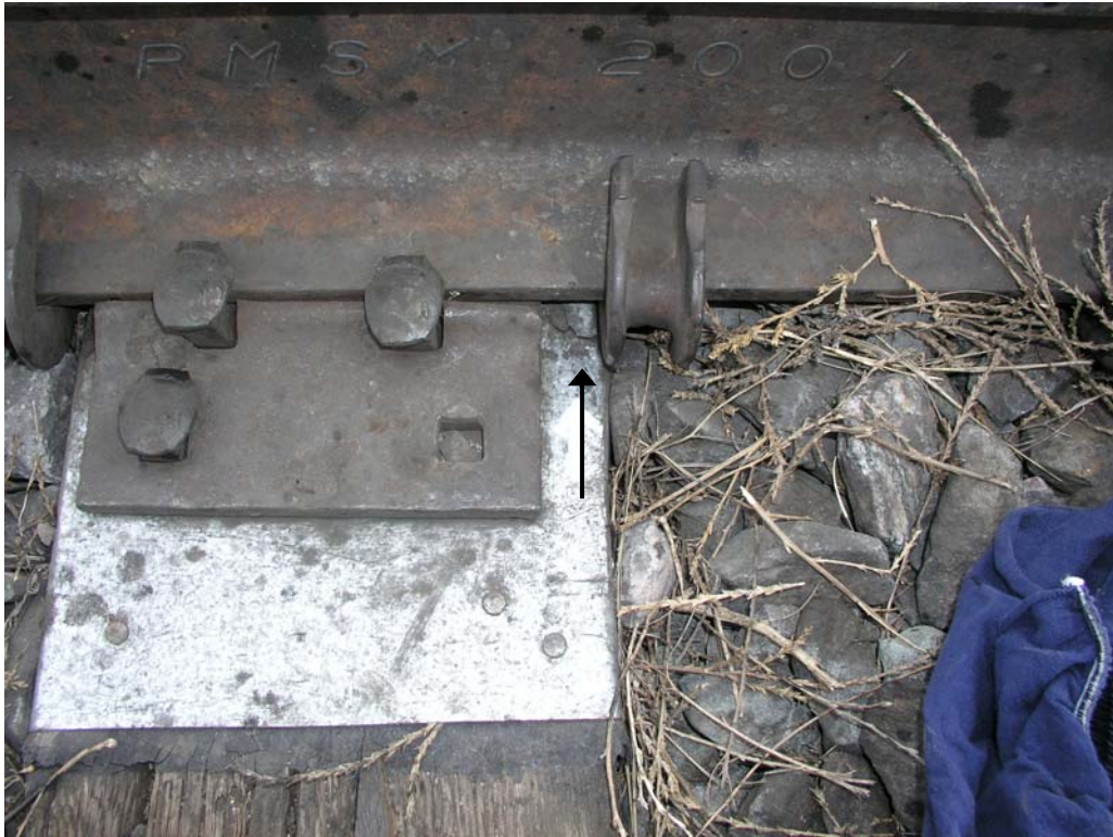
Figure 10. Heavier Cover Plate Damaged by Rail Anchor