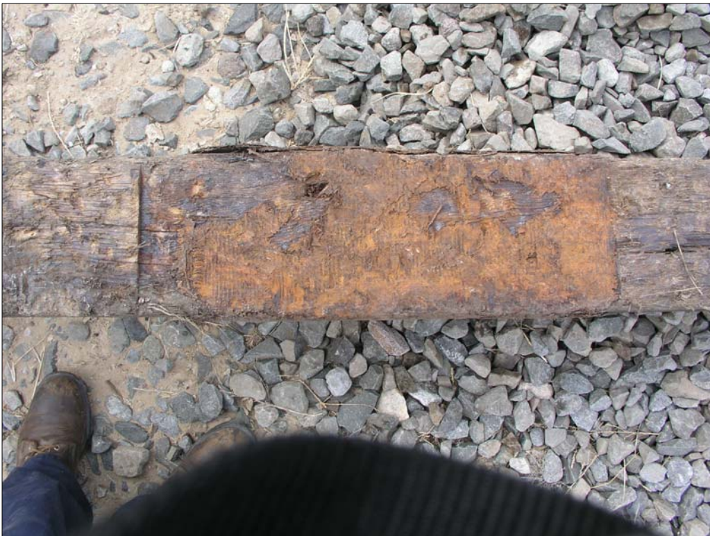
Figure 7. Bottom of Tie Removed From Track Showing Wrap in Poor Condition