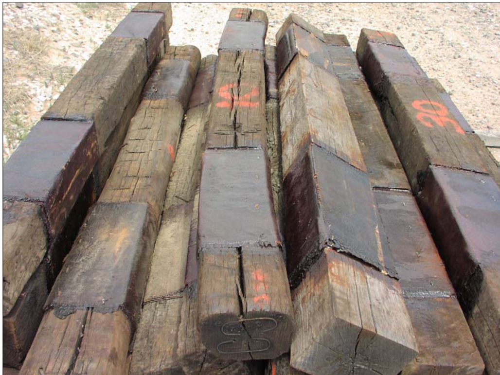
Figure 1. Wrapped Ties before Installation

The ties were visually inspected at the start of the test and at 25 MGT intervals. Figure 1 shows the ties before installation. During the test, the portion of fiberglass wrap that was visible under typical track conditions was inspected. At the conclusion of the test, ballast was moved away from two ties to document the condition of the sides of the ties. At the same time, two ties were removed by pulling them through the ballast section to expose the bottoms of the ties and to determine if removal in this manner caused damage to the wrap. Tie plates were removed from the ties that had been removed from the track to allow observation of the condition of the wrap that had been under the plates.