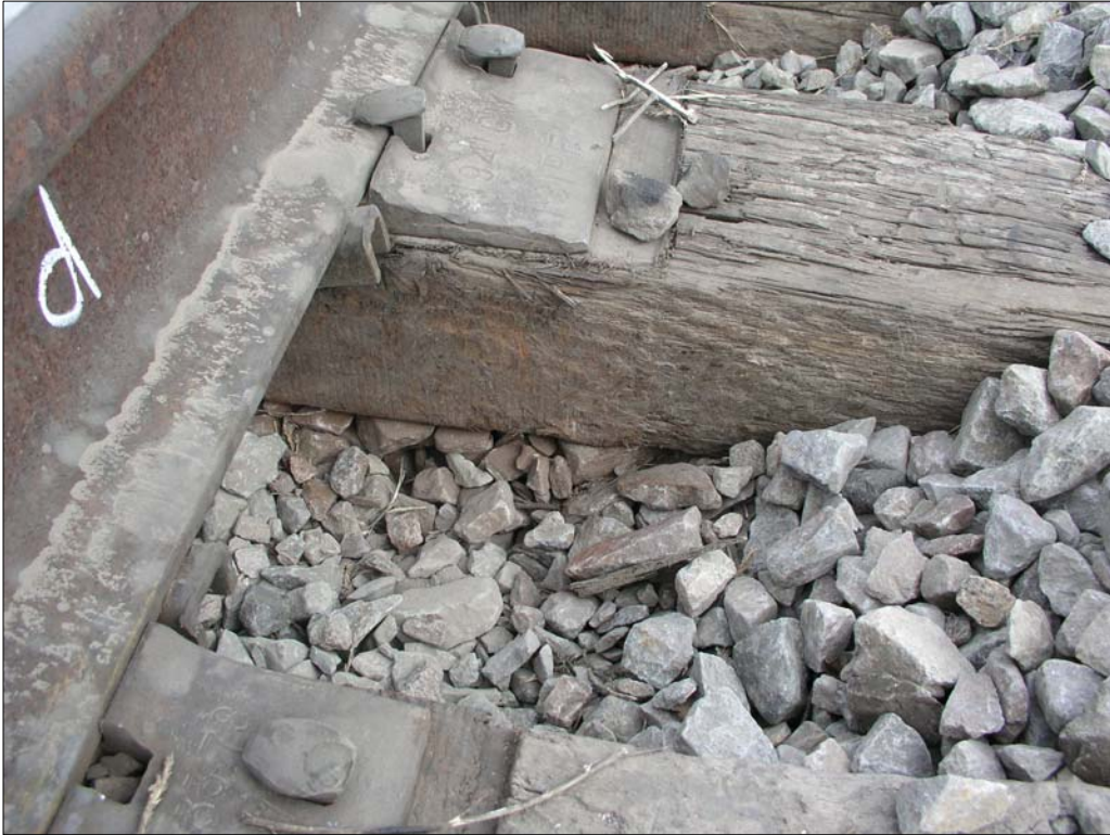
Figure 4. Side of Tie with Ballast Moved to Expose Wrap (poor condition)