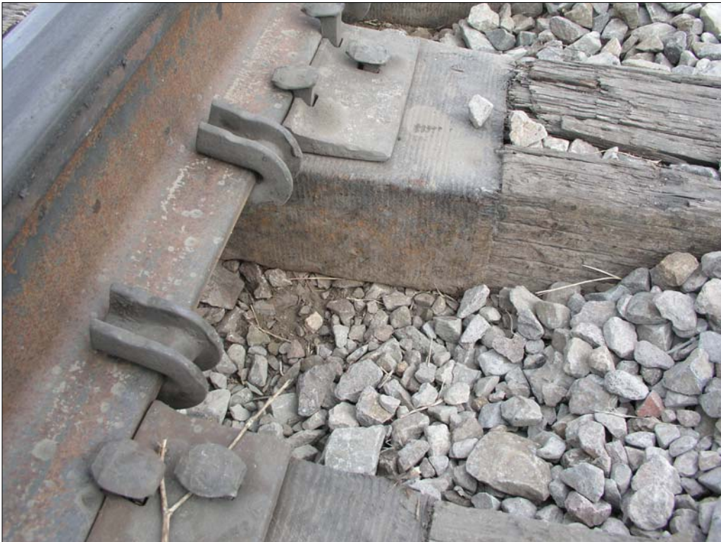
Figure 5. Side of Tie with Ballast Moved to Expose Wrap (good condition)