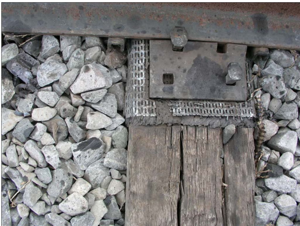
Figure 11. Perforated Cover Plate Damaged by Tie Plate