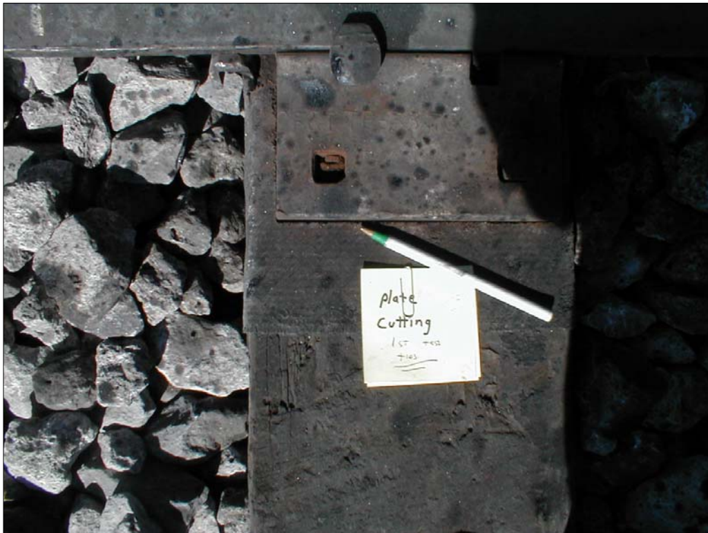
Figure 3. Tie Plate Cutting into Wrap