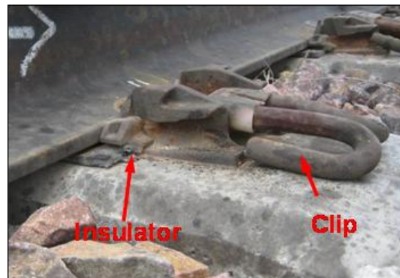
Figure 1. Example of Rail Fastener for Concrete Tie Track (note that the clip shown is not engaged on the rail)

The research is funded jointly by the Federal Railroad Administration (FRA) and the Association of American Railroads (AAR) under the HAL revenue service testing program.