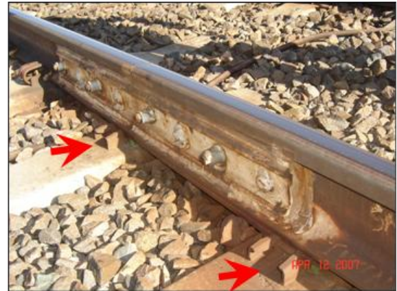
Figure 2. Example of Missing Fasteners in Revenue Service

measurements may help railroads develop and optimize their track maintenance practices.