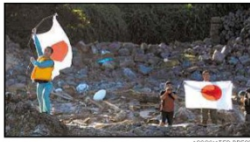
Japanese activists hold national flags on the disputed island of Uotsuri on Sunday.