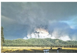
once the lightning struck, the flames began to spread quickly. The fire forced the closure of Highway 44 and other roads and prompted the declaration of a