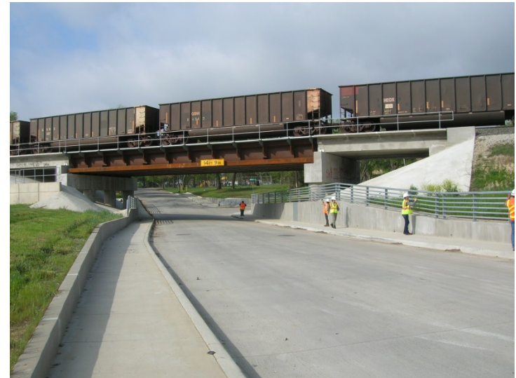
Cold Spring Road After Reconstruction