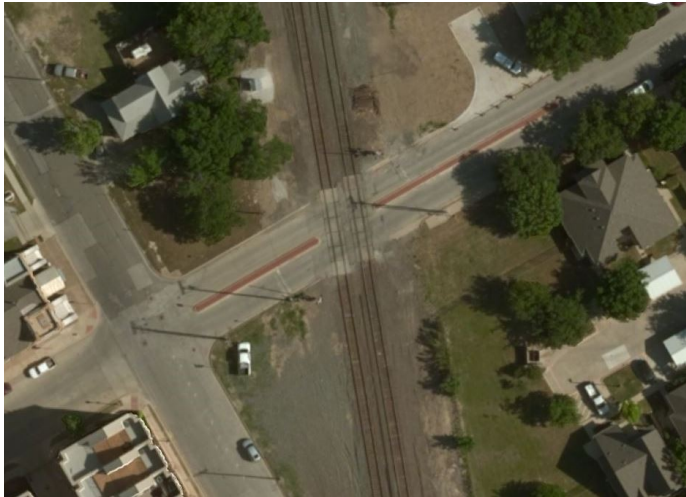
First Street Crossing Before Closure