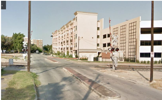
Old Route to School via Peach Street Grade Crossing, Now Closed

New Route to School via Improved Gounah Street Underpass