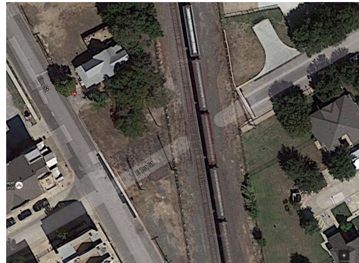
First Street Crossing After Closure