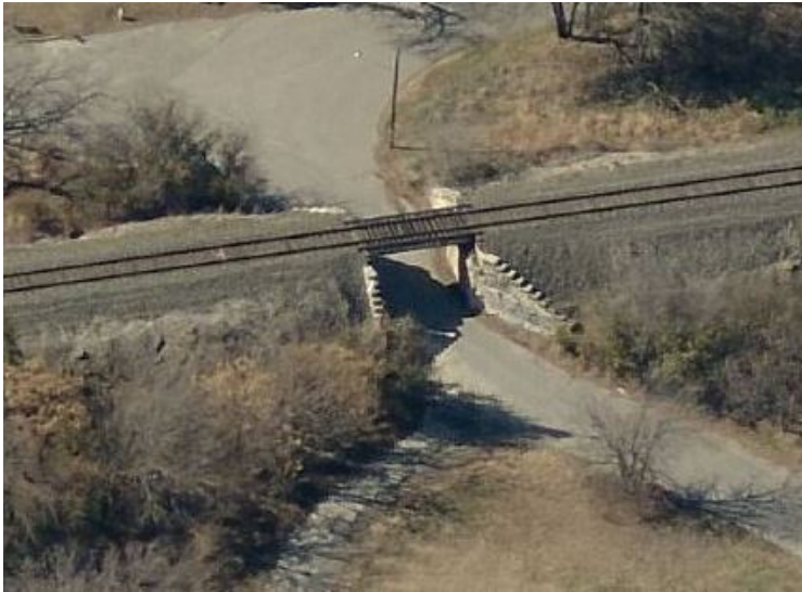
Cold Spring Road Before