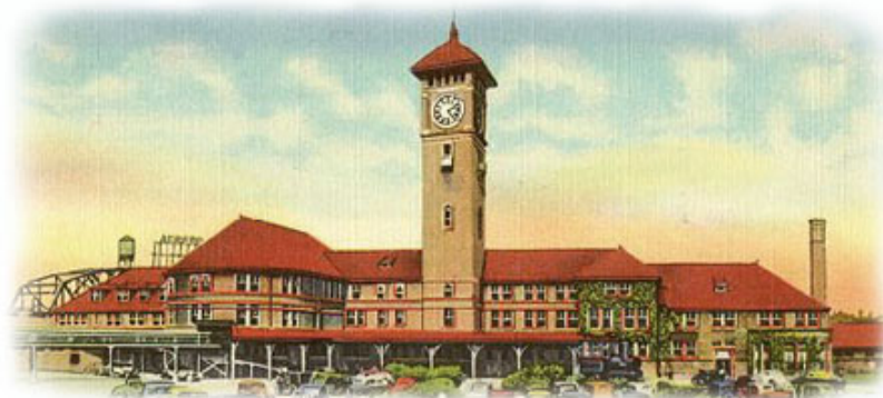
Portland Oregon Union Station