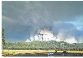
once the lightning struck, the flames began to spread quickly. The fire forced the closure of Highway 44 and other roads and prompted the declaration of a