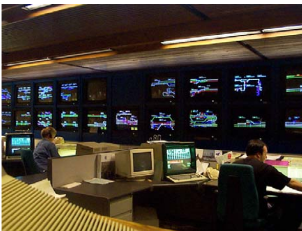
Figure 1. Railroad dispatcher's office

Railroad dispatchers (see Figure 1) shoulder more responsibilities today than ever before due to changes in technology, operating practices and the economy. In their capacity as rail traffic controllers, dispatchers play an integral role in rail safety. In the 1990s, the Federal Railroad Administration (FRA) raised concerns about the safety of the U.S. rail network in two separate audits (FRA, 1990; 1995). One area of concern was periodic work overloads. Due to their central role coordinating rail traffic, railroad dispatchers are the lynch pin of railroad operations. Thus, dispatchers must perform optimally under all circumstances to ensure safe operations. A breakdown in dispatcher performance can lead to delays, or worse, fatalities. For example, dispatcher performance was cited as a contributing factor in a fatal collision between two trains in 1997 (NTSB, 1998).