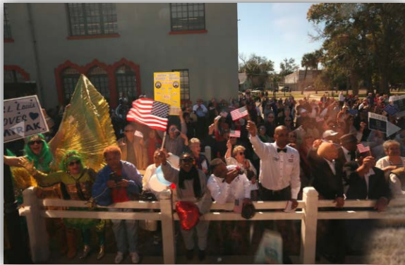
Feb. 18 – 19, 2016 Amtrak Inspection Train