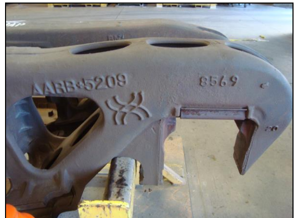
Figure 2. Cracked pedestal jaw of a side frame removed from service

Approximately 70 bolsters and 55 side frames were examined for this survey. In a few cases, multiple defects were evident in one casting. Figure 2 shows the cracked pedestal jaw area of a side frame removed from service.