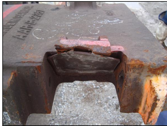
Figure 1. Cracked pocket in a bolster removed from service

For side frames, cracked pedestal jaws and bent pedestals totaled 50 percent of side frames removed from service, and worn columns accounted for nearly 20 percent.