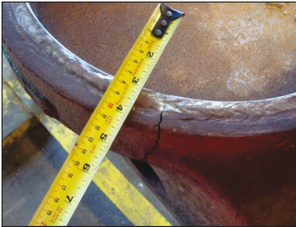
Figure 4. Cracked bowl in bolster removed from service

The majority of the bolster defects were cracked pockets and worn pockets. Old castings, rail burns, cracked webs, and cracked bowls were the other leading defects in bolsters. Figure 4 shows a cracked bowl in a bolster.