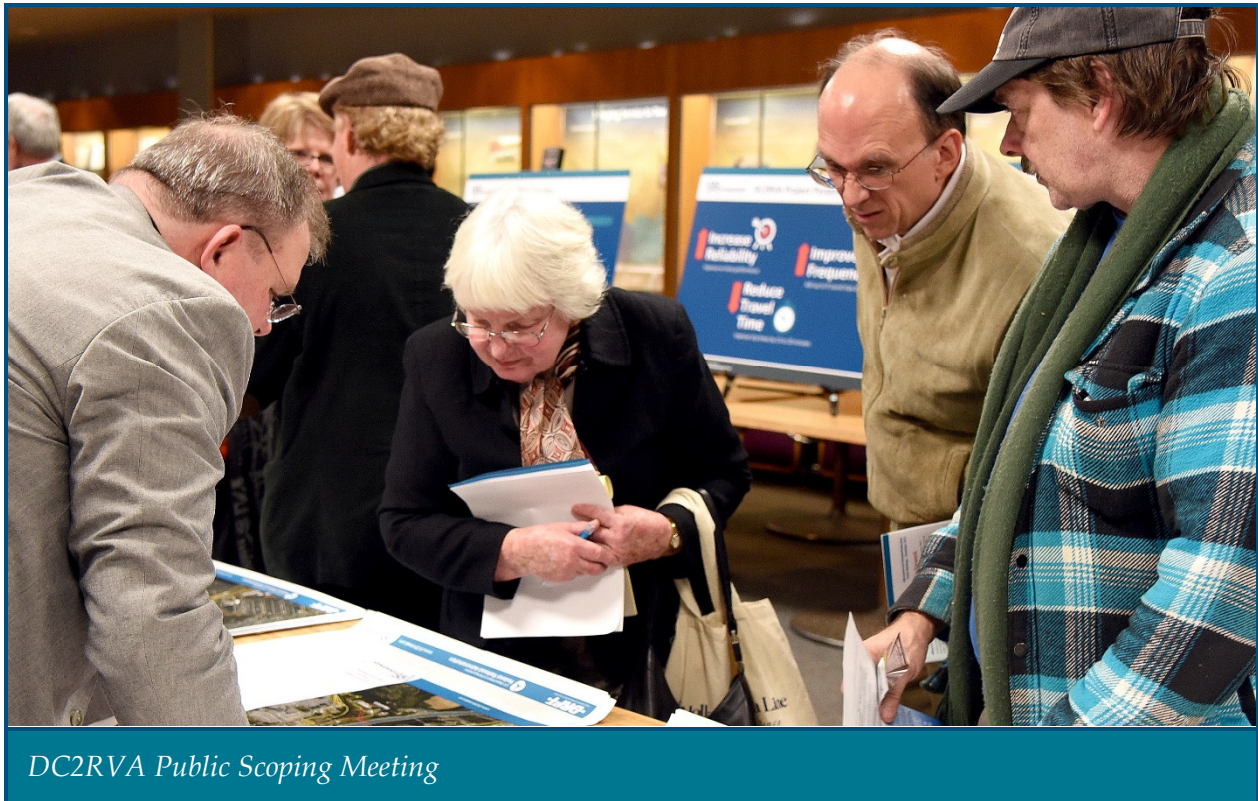
DC2RVA Public Scoping Meeting