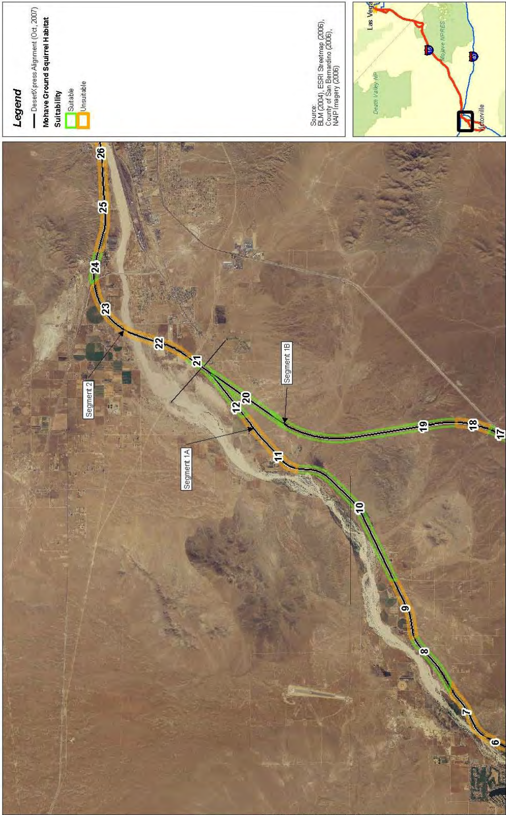
Mohave Ground Squirrel Habitat Suitability along the DesertXpress Rail Project Alignment