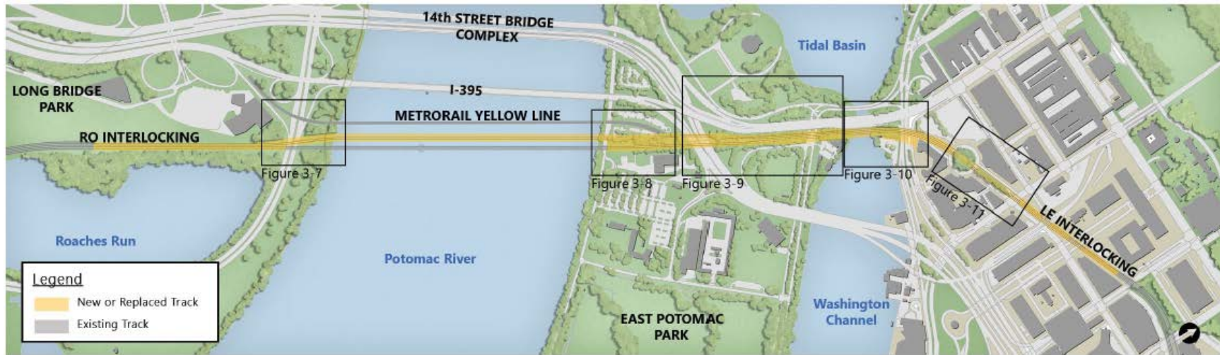
Figure 1: Preferred Alternative