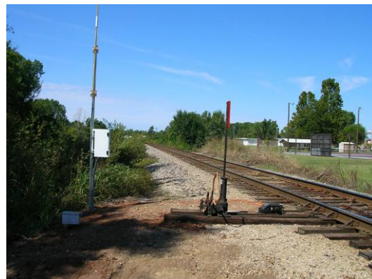
Figure 4. A Typical Installation

The technology being used is a mix of mature and proven products, as well as technology applied in rail and other industries. The SPMS will build upon this proven foundation to provide an additional layer of protection in train operations. The technology and infrastructure is transferable to existing networks of other railroads, allowing this innovative, closed-loop technology to improve freight and passenger train safety industry-wide.