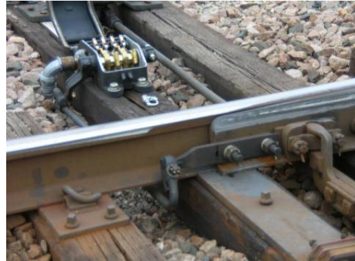
Figure 2. Apparatus at the Switch

The demonstration system involves the installation of switch position monitoring devices on areas of track where switches are outside of signal systems and restricted limits operations. These monitoring devices communicate through a data radio to a data network, then onto a train dispatching system. The dispatching system software checks the position of the switches before allowing the issuance of track warrants, thus eliminating the potential of issuing a track warrant over a switch that was not properly lined for train movement.