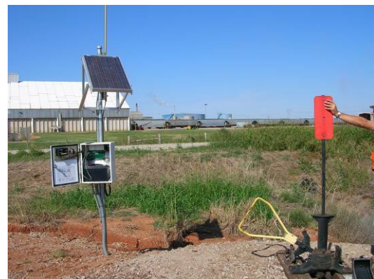
Figure 3. Solar-Powered Wayside Interface with Radio

Closed-loop methodology safeguards against loss of communication from the wayside to the back office and assures that the switch position reported from the wayside is timely and not latent information. In the event that the communication