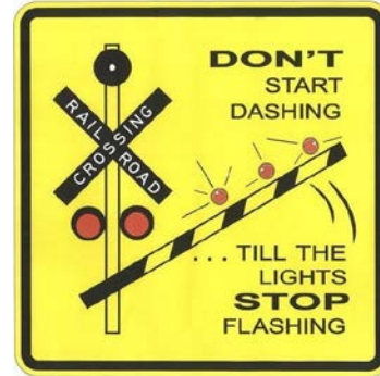
Figure 4. Warning Sign at Elmhurst, Illinois

The Elmhurst Police Department developed a warning sign to address the ongoing issue of pedestrians starting to cross the tracks prior to the warning devices completing their activation. Metra stations in Elmhurst and many other communities in northeastern Illinois often have a second train at or approaching the station, necessitating the reminder that it is illegal to cross the tracks until the warning devices have completed their activation cycle.