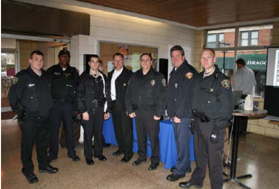
Figure 2. Law enforcement staff at an E&E Blitz at the Elmhurst, IL, Metra station

The education element of PEERS was founded on the principles of Operation Lifesaver (OL), a non-profit organization committed to raising awareness and improving public safety around highway-rail grade crossings and tracks through public awareness and education programs. Educators were also encouraged to develop innovative approaches to reach the citizens of Illinois.