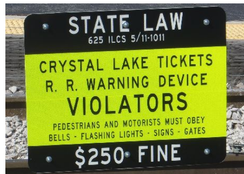
Figure 1. Example Enforcement Signage

The majority (86 percent) of grants were awarded to police departments in Illinois. Between July 1, 2003, and June 30, 2012, more than 18,000 traffic law citations or warnings were issued by 58 local police departments and special agents of the Union Pacific Railroad and the Canadian National Railway. Police conducted more than 18,000 hours of enforcement activity yielding an approximately one-to-one ratio of hours of effort to number of citations or warnings issued. The average cost for 1 hour of law enforcement labor was $57.08.