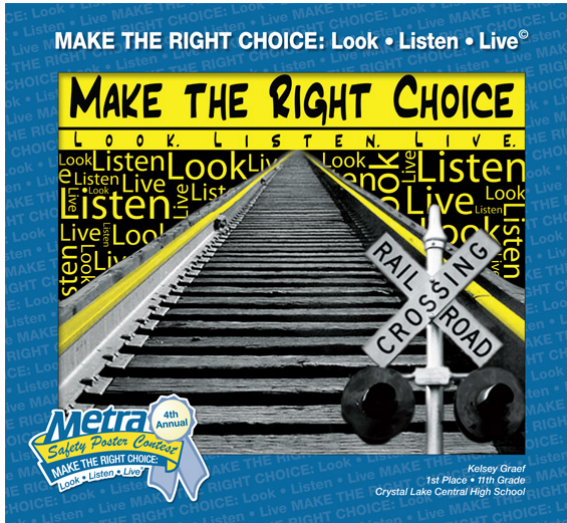
Figure 6. Metra – “Make the Right Choice”