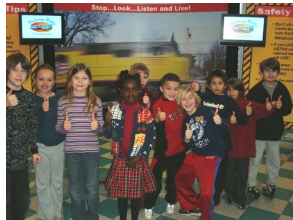
Figure 5. Health World Railroad Safety Rally

Health World Outreach, a safety based non-profit agency, developed the Railroad Rally Safety Game to reach their target audience of school-age children. Health World takes the portable game to schools in the region and challenges students to correctly answer rail safety questions.