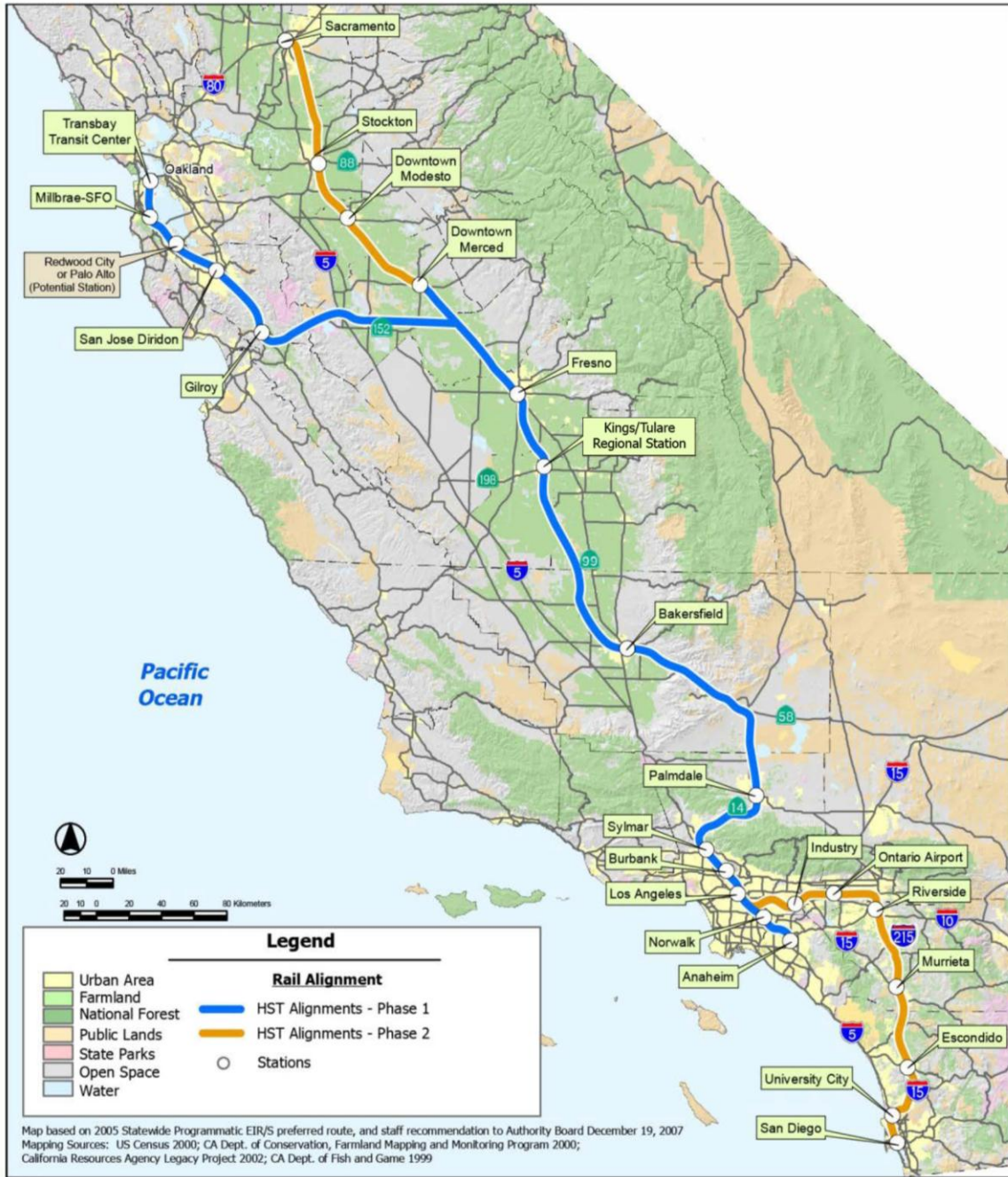
Figure S-1 California HST System initial study corridors