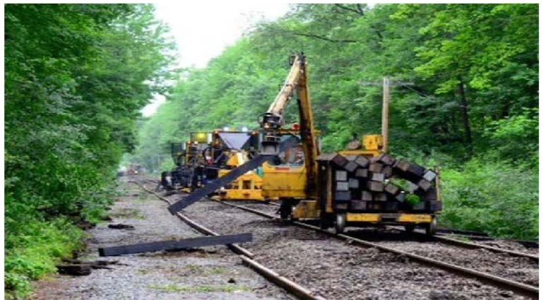
Rail Line Rehabilitation in Western Massachusetts