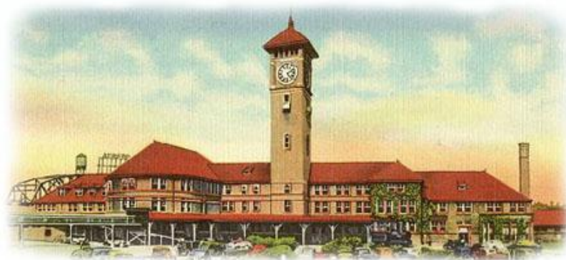
Portland Oregon Union Station

WS DOT • Pacific NW Rail Corridor Program • Vancouver-Port Access Rail Improvements – FD/Construction • Tukwila Station Improvements – FD/Construction • PNWRC Mount Vernon Siding Extension – FD/Construction • King Street Station Seismic Retrofit • Washington State Rail Plan